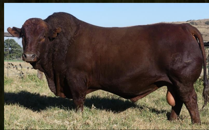
LAR18-041 (1 son on sale) SIRE: LAR14-173