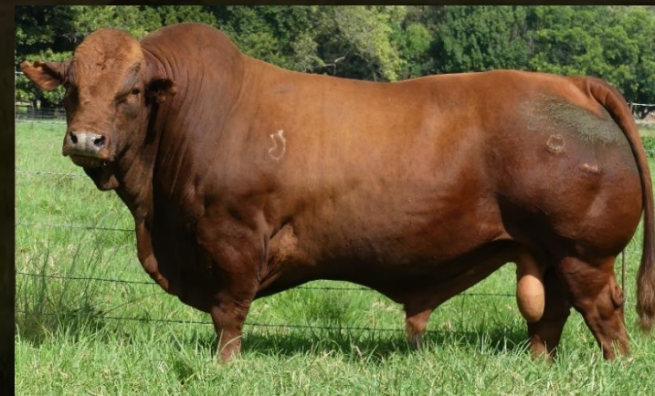
LAR17-292 (1 son on sale) SIRE: LAR14-173