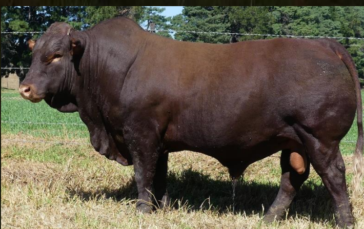
LAR20-104 (6 sons on sale) SIRE: LAR18-041