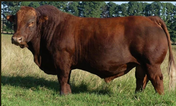
LAR17-358 (13 sons on sale) SIRE: JRP11-073