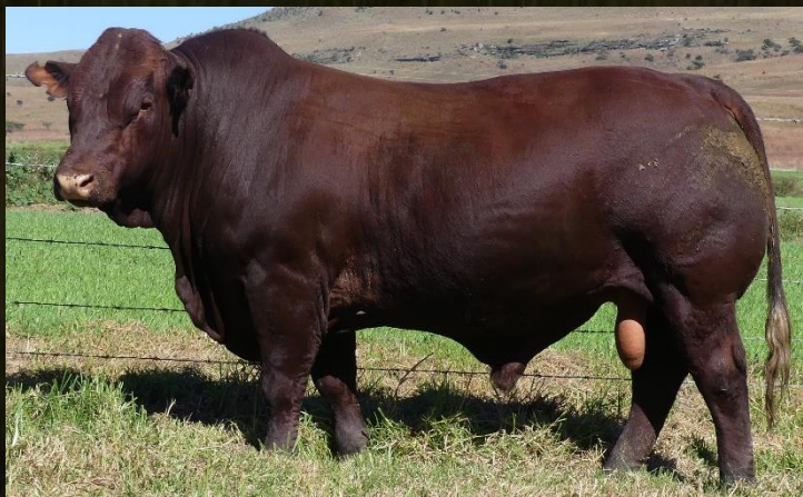
LAR19-144 (4 sons on sale) SIRE: LAR16-053