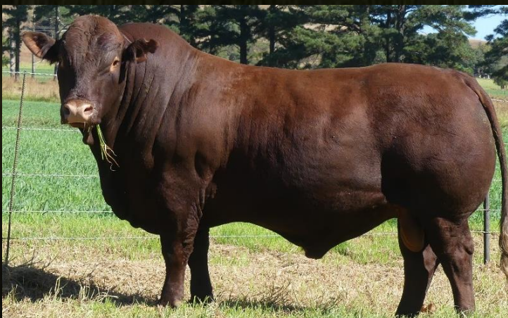
LAR17-467 (3 sons on sale) SIRE: LAR14-064