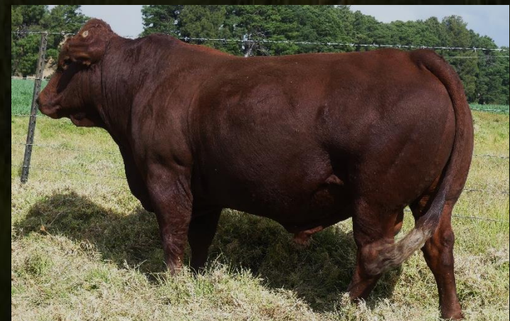
LAR18-016 (7 sons on sale) SIRE: LAR14-173