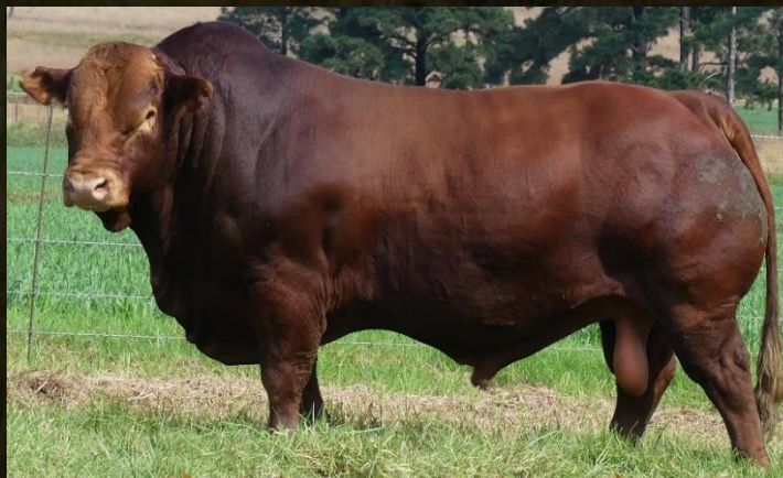
LAR19-373 (4 son on sale) SIRE: LFR15-032