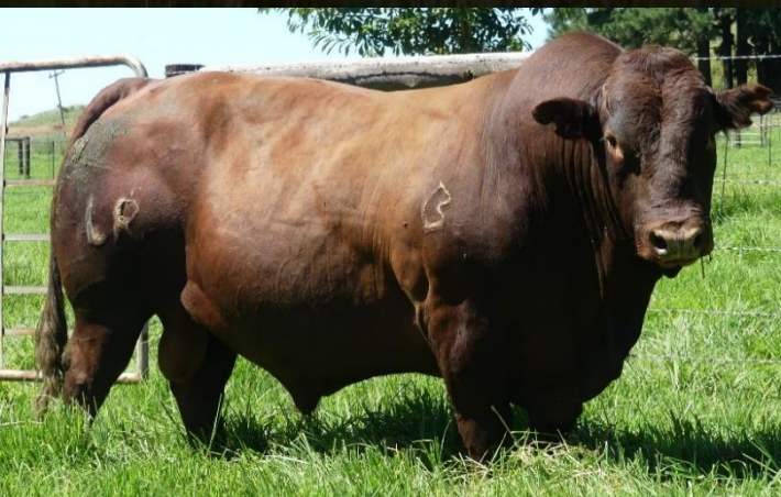
LAR18-039 (7 sons on sale) SIRE: LAR14-200